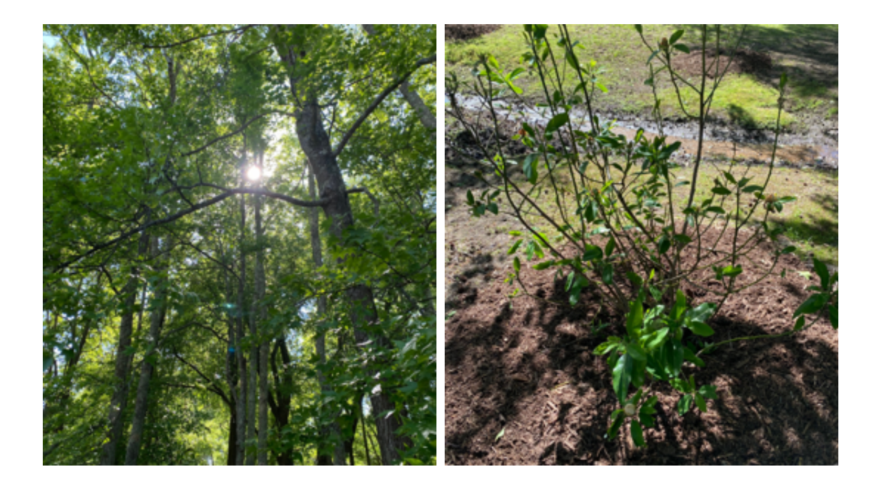
May 25th meeting – Agenda and YouTube videos.

Additionally, Council unanimously approved a Tree Planting Grant Program. In an effort to respond to citizen requests for more tree canopy in Apex, this program is designed to provide incentive funds to property owners and tenants to plant trees on residential private properties within Apex's corporate limits. Read more about the grant program <a href="here">here</a>.